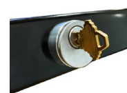
Keyed cylinder lock