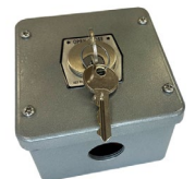
Key Switch Open/Close