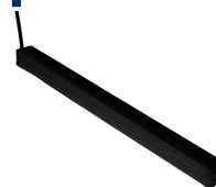
Bottom Sensing Edge