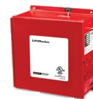
Fire Link release device