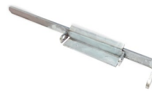
Slide Bolt Lock