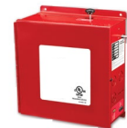
Fire Link release device