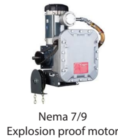
Nema 7/9 Explosion proof motor