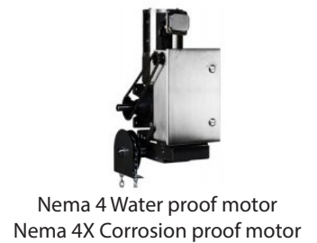
Nema 4 Water proof motor Nema 4X Corrosion proof motor