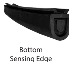
Bottom Sensing Edge