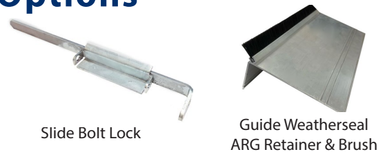
Slide Bolt Lock