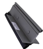
Steel Double angle Bottom bar