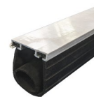
Bottom Sensing Edge