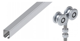
FACsrI Track & Rollers